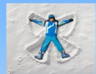
Fun in the snow