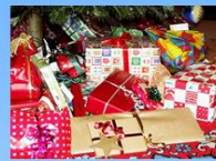
Give gifts to others

This Winter/ Christmas half term we would like you to spend lots of time with your friends and family making lots of wonderful memories.